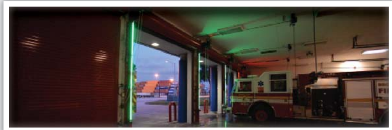
Lights are GREEN when doors are fully open, clearly indicating when the driver can GO.